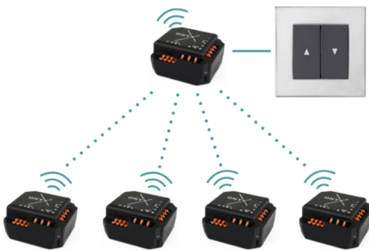
Option 1: Group control by radio